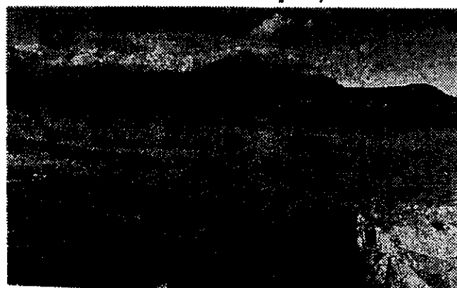
Looking across to Goatfell, Arran from Brodick

To conclude, a few points are worthy of mention. During our trip we came across two geology student groups and judging by their comments and my untrained eye I would judge the island as a classic site for those interested in the subject. To borrow the words of a friend, Arran is a "microcosm of Scotland" offering the outdoor lover a varied arena for walking and climbing as well as allied activities. Wild camping is discouraged by the authorities but I am sure they would have no objections to "professional" campers. However, if camping within sight of civilisation, it would be best to go to official sites. The months of April and May are regarded locally as having the best weather reliability, with long daylight hours and no midges. If you visit north Arran I feel sure you will not be disappointed and like us, want more.