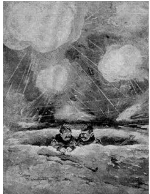
"Well, if you knows of a better 'ole, go to it."