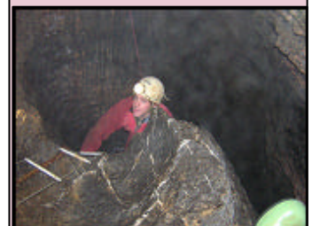
... and Jeff on the ladder pitch in Waterwheel