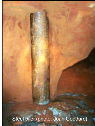
Steel pile

The lead – it had to be of exactly the right chemical composition - formed spheres as it solidified in the water. Watts converted his house into a shot tower by extending up (through the roof) and by digging downwards (into the caves) to achieve a sufficiently long drop for the lead shot to form. Production continued here until 1968 when it was transferred to a new shot tower built nearby and the Watts tower was demolished for a new road scheme. Sadly, ACG's efforts to reach the base of the shot tower have been unsuccessful due to infill and unstable passage.