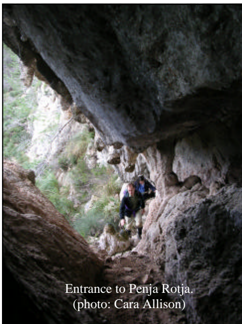
Entrance to Penja Rotja.

followed in 1992. This just requires a 15m rope for the rift that drops down in the floor of the entrance gallery, a handline for the final climb to the pretties at the bottom, and a few tape slings for the flowstone slope in the galleries. With hindsight a rope would also be useful in the Pierre's Pot type slot that bypasses the normal pitch route to the bottom, "Pou Negre". This again proved rather sporting for the less experience members of the party. As in previous years Penja Rotja was hot and humid in the lower levels so it is actually quite an energetic trip. So we were out after dark, which made for a stumbling walk back to the car.