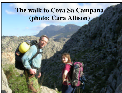
The walk to Cova Sa Campana

followed in 1992. This just requires a 15m rope for the rift that drops down in the floor of the entrance gallery, a handline for the final climb to the pretties at the bottom, and a few tape slings for the flowstone slope in the galleries. With hindsight a rope would also be useful in the Pierre's Pot type slot that bypasses the normal pitch route to the bottom, "Pou Negre". This again proved rather sporting for the less experience members of the party. As in previous years Penja Rotja was hot and humid in the lower levels so it is actually quite an energetic trip. So we were out after dark, which made for a stumbling walk back to the car.