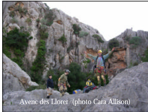
Avenc des Llorer

right. Go through this gate and walk around the field to a stile on the far side. Climb over the stile and then follow the farm track beyond. A government sign soon after confirms that you are on the right track. Turn right at a junction after 100m or so and then keep going until the track peters out at a small hut. From there follow a well cairned, and intermittently red paint splashed path for another 300m across the flat valley floor to dry stonewall. There is a small gate in the wall. Just through there and on the left is Avenc S'Aigo. To find Llorer walk down the path for another 80m or so, crossing right over a cave in the path, where a shallow descending valley heads off on the left. Head down this valley, not the main path, for 3-400m on a bearing of roughly 340°; we've started a series of cairns to help with navigation. The cave is situated underneath a sharp peak of rock, and the back wall is a flash of red/brown rock festooned with ivy. You can actually see the red back wall from the main footpath.