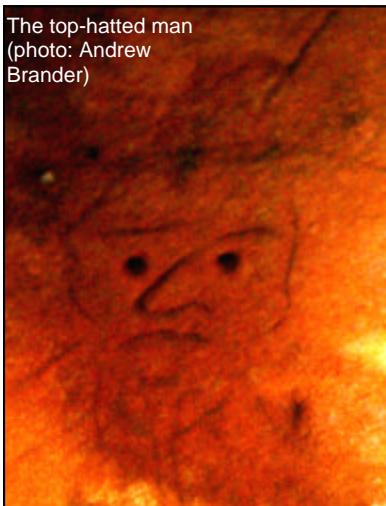
The top-hatted man

The chamber walls retain inscriptions dating back to 1761 and near the entrance there is a picture of a man sporting a Brunel style top hat (possibly drawn at the time a railway tunnel was cut through the caves). Some of the chambers have had their roofs strengthened by railway-type arches (built by the Midland Railway Company which bought nearby King's Wharf in 1912)