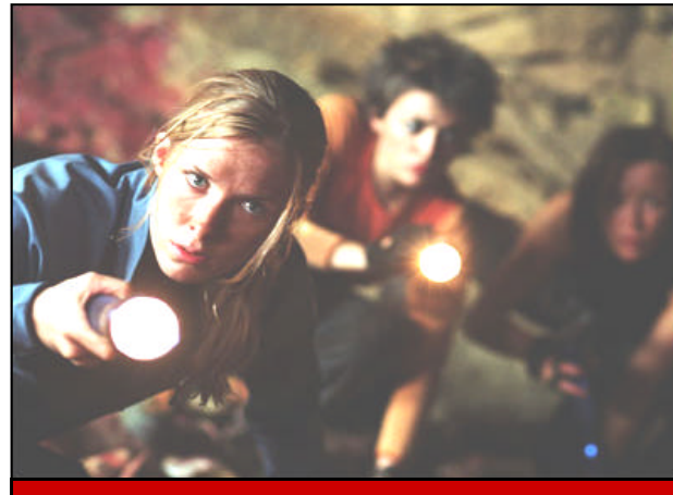
THE DESCENT FILM REVIEW

Hesketh tried caving on a whim, and grew to like it very much, because, she says, "it's a head rush, exhilarating and exhausting. In Scotland, it's wet, more like