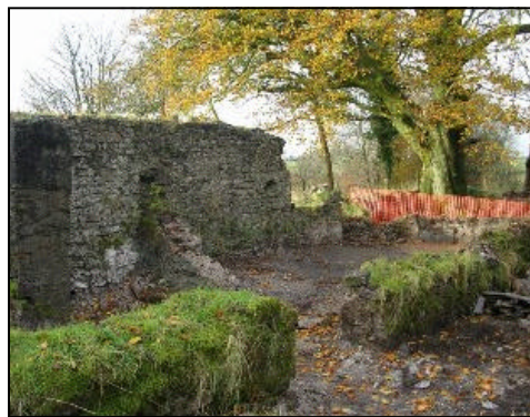
Above Nordrach Cottage as it is today