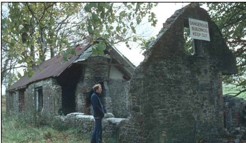
Right The same cottage in the 1980's