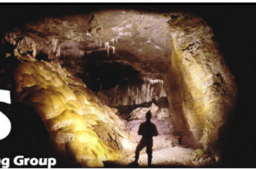
Departure Lounge, Upper Flood (by Charlie Allison)