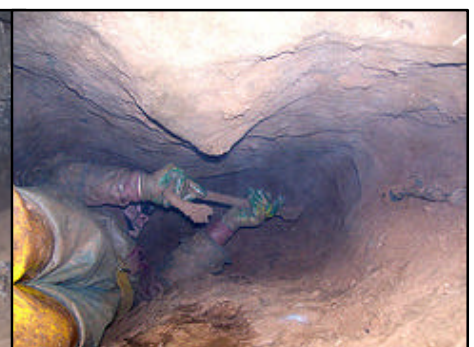
Rift Series