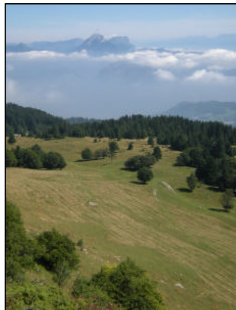
View north (Chartreuse and Mont Blanc) from Pas de Bellecombe

After a discussion with the congress caving organisers we selected Grotte des Ramats at St Martin as our objective. An interesting local travel problem currently existed (and will persist for a couple of years to come). Extensive ongoing roadworks in the Gorge de la Bourne resulted in intermittent road closures between Villard-de Lans and Pont-en-