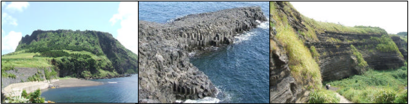
Left to right: Seongsan Ilchulbong, Daepodong, and Suwolbong

the Seongsan Ilchulbong Tuff Cone, columnar joints at Daepodong, sweeping sea cliffs of tuff at Suwolbong and the Jeju Stone Park. In the distance Mount Hallasan dominates the landscape of Jeju wherever you are and there are secondary fumaroles all over the place. Indeed Hallasan is actually the highest point in Korea. Overall Jeju is a fascinating landscape and not something I'd really experienced before. I would definitely recommend a stop over in Jeju Island if you are ever in the region.