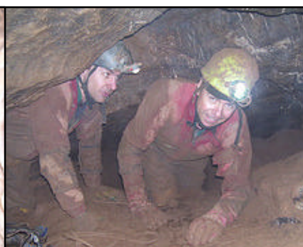
Rift Series