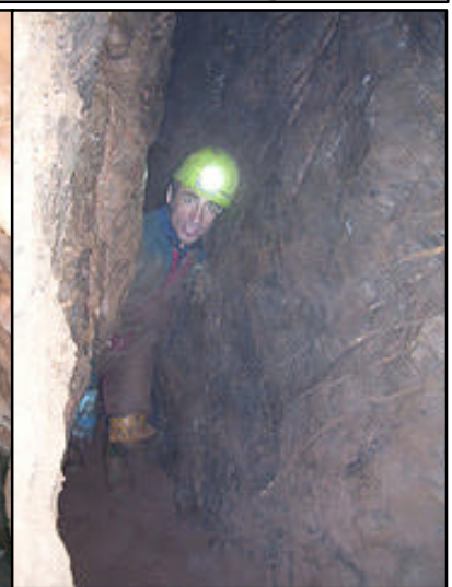
Rift Series