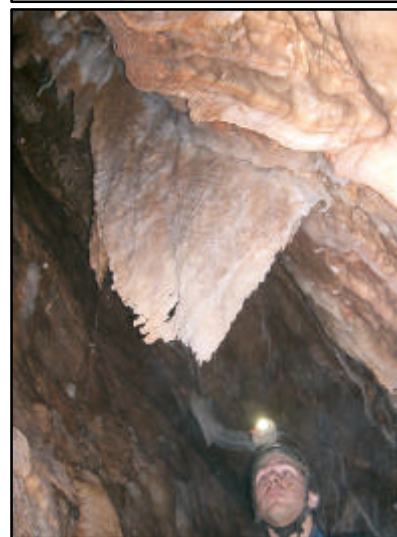
Royal Icing