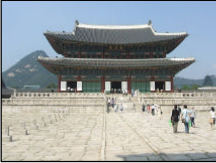
A temple in Seoul