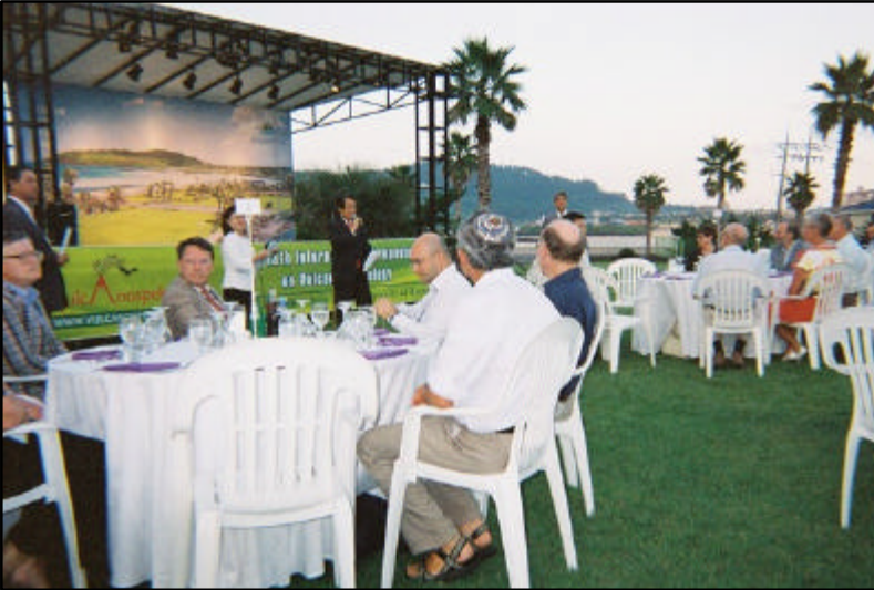
The open-air banquet with the Governor

Ah, the socialising. The conference opening was a very formal affair with addresses by various local dignitaries, conference organisers and UIS gravy-trainers. And on the first evening we had a formal open-air banquet on the hotel lawn overlooking the sea. The Governor of Jeju even gave the opening speech. The buffet was huge, the