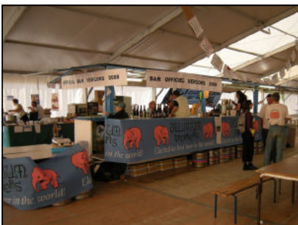
The 500-seat Speleobar marquee

An interesting aspect of the actual presentations to a live audience was the eagerness of the audience to understand. Simultaneous translation into French and English was available via radio broadcast to personal earpiece sets.