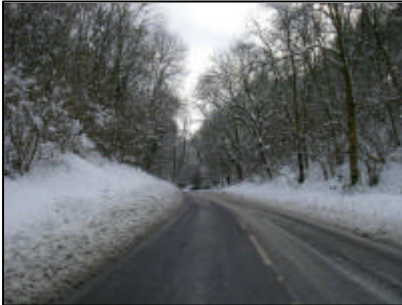
07/02/08 Burrington Combe closed