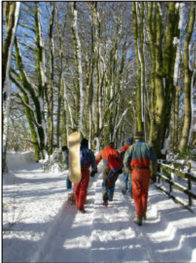
07/02/08 Caving or snowboarding?