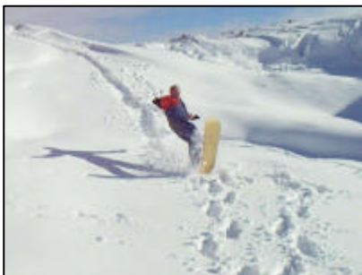
07/02/09 Powder on Charterhouse