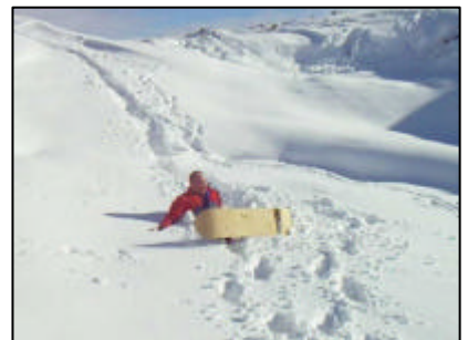
07/02/09 That broke it!