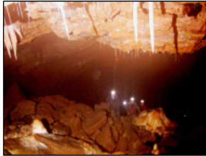
Ascending Great Chamber, GB