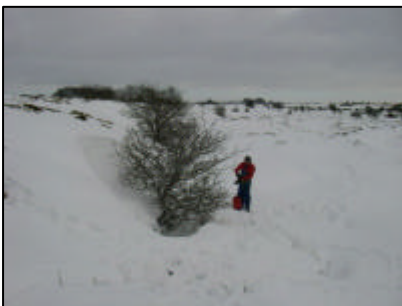
07/02/09 Rakes venting warm air