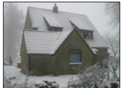
05/02/09 Before the heavy snow