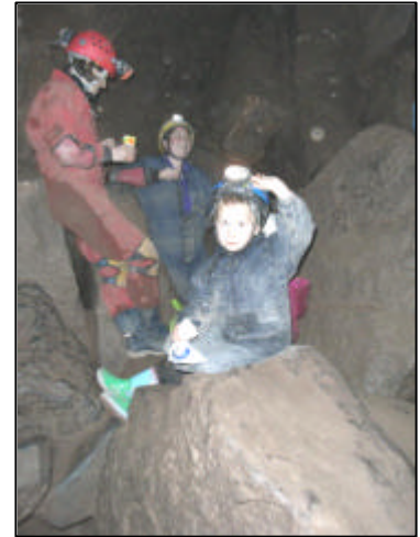
Family trip in Goatchurch

If there are any more families that wish to join us, please let me know - everyone is welcome. Also if there is anyone else who is prepared to help out on a kiddies caving trip and help build sand-castles, please shout. Any offers of small caving kit also gratefully received!