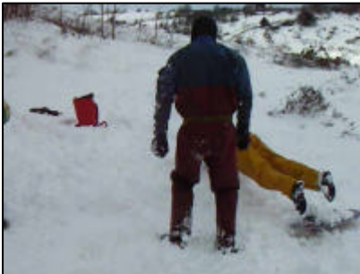
07/02/09 Ed waters dives for cover