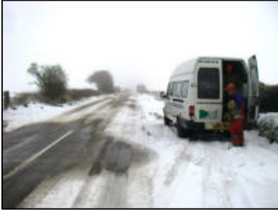
05/02/05 before heavy snow arrived