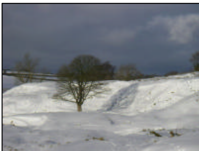
07/02/09 What a day