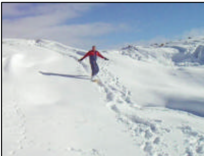
07/02/09 Giles takes off