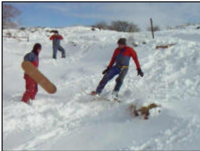
07/02/09 Giles heads for UFS