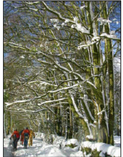
07/02/09 Walking to UFS