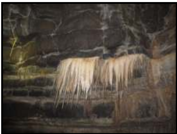
Formations in OFD II, Photo: Emma Lambert.