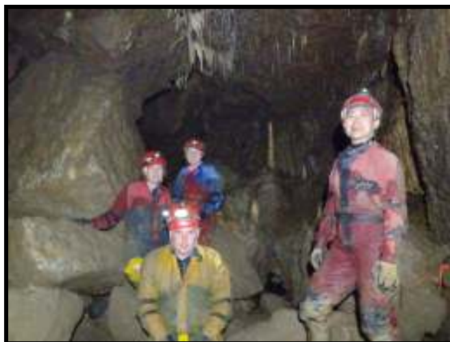
Legnabrocky Way, Photo: Kev Speight.

There really isn't much to Skreen Hill 2, although there are some nice stalactites in the roof. The only way on for the 'dry' caver is through a gravel in the stream into the Legnabrocky Way, which is a fabulous kilometer or so of varied caving, including some very large and impressive chambers, not to mention fine formations. We followed it to the bitter end, where a calcited climb leads to a small, very strongly draughting slot in the roof.