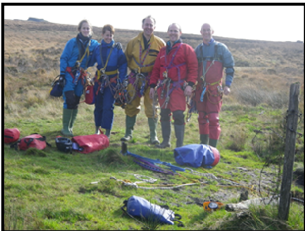
Outside Pant Mawr Pot