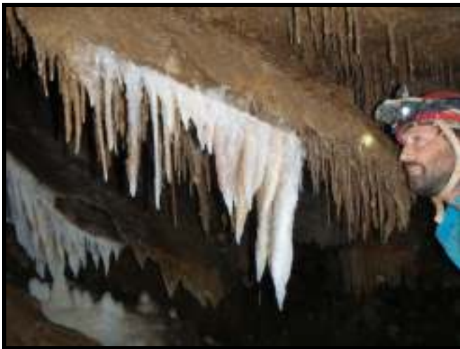
Grotte de la Roque Bleue, Photo: Tony Knibbs.

easy. I had expected the name of the cave to have referred to some of the formations, but it actually refers to the rock itself, which occasionally took on a pale indigo colour. The formations themselves were either pure white or a creamy off-white colour; most resembled crystalline hedgehogs of different shapes and sizes.