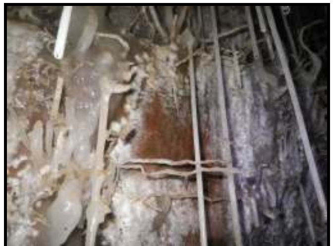
Helictites in Pant Mawr Pot

The passage was mostly large and over boulder collapses with a few chokes. We then reached the aptly named 'Straw Chamber', down into the 'Great Hall' where we carried on to the sump – as far as we could go. On the way back we entered the large passage with the some of the prettiest formations that I've seen; lots of helictites, straws, stalactites and flowstone (another note to self: slippery rock + 'tricky for small people climb down' = very painful elbow and a lot of swearing).