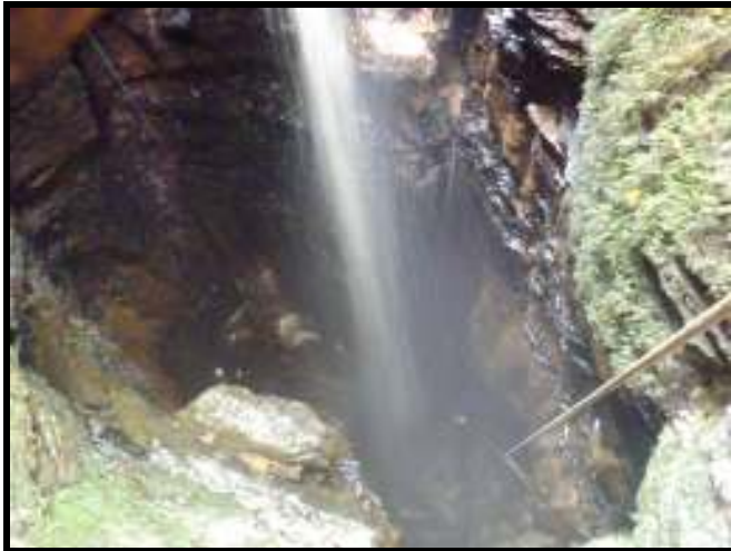
Noon's Hole entrance shaft