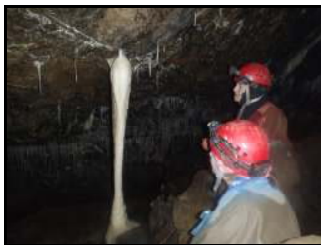
Pillar in Shannon Cave