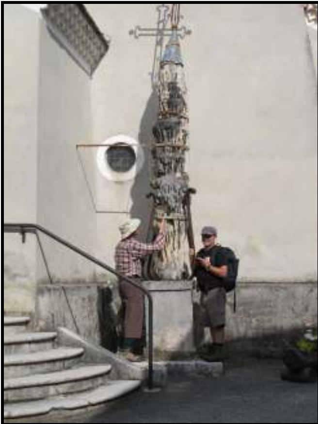
The stalagmite in St Julien en Vercors