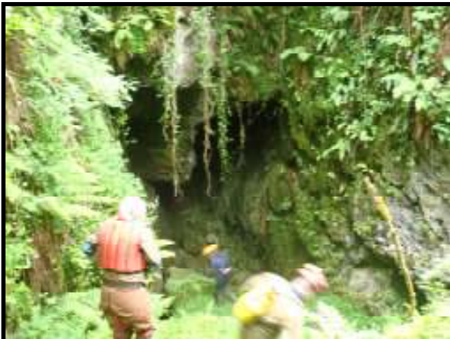
Entrance to Polnagolum of the Boats, Photo: Kev Speight.

On Sunday, Les and his partner, Aileen, met up with us for a trip in Polnagollum of the Boats. This impressive, but fairly short river cave is hydrologically linked to the Marble Arch system. The entrance was like something from Jurassic Park, with curtains of intertwined foliage cascading everywhere, followed by a descent through a choke of massive boulders into the main river itself.