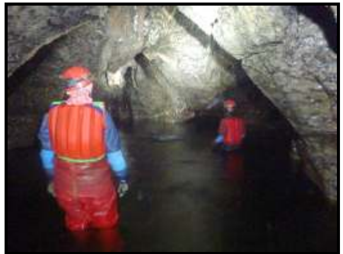
Streamway in Polnagollum of the Boats