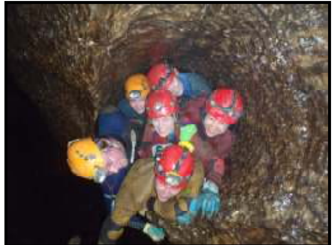
The MCG in Pollnagollum of the Boats, Photo: Kev Speight.